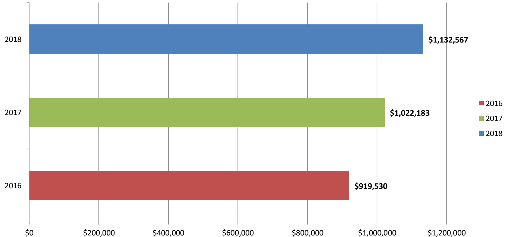
Total Sales Average per Advisor